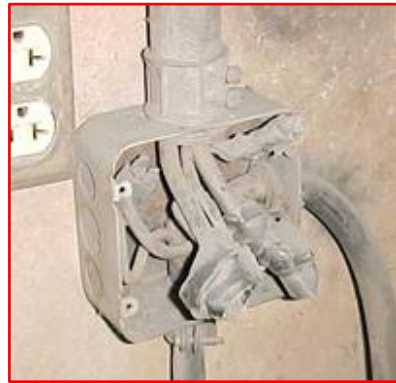
Missing Cover over Junction Box