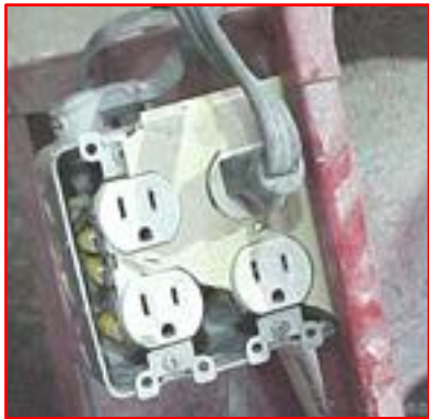
Broken Cover over Receptacle