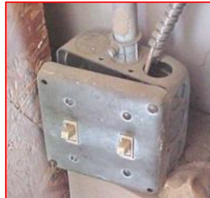
Missing Conduit "Knockout" and Loose Switchbox Cover